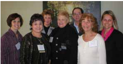
Luncheon sponsor and 2008 Business of the Year Solon Creative Playrooms